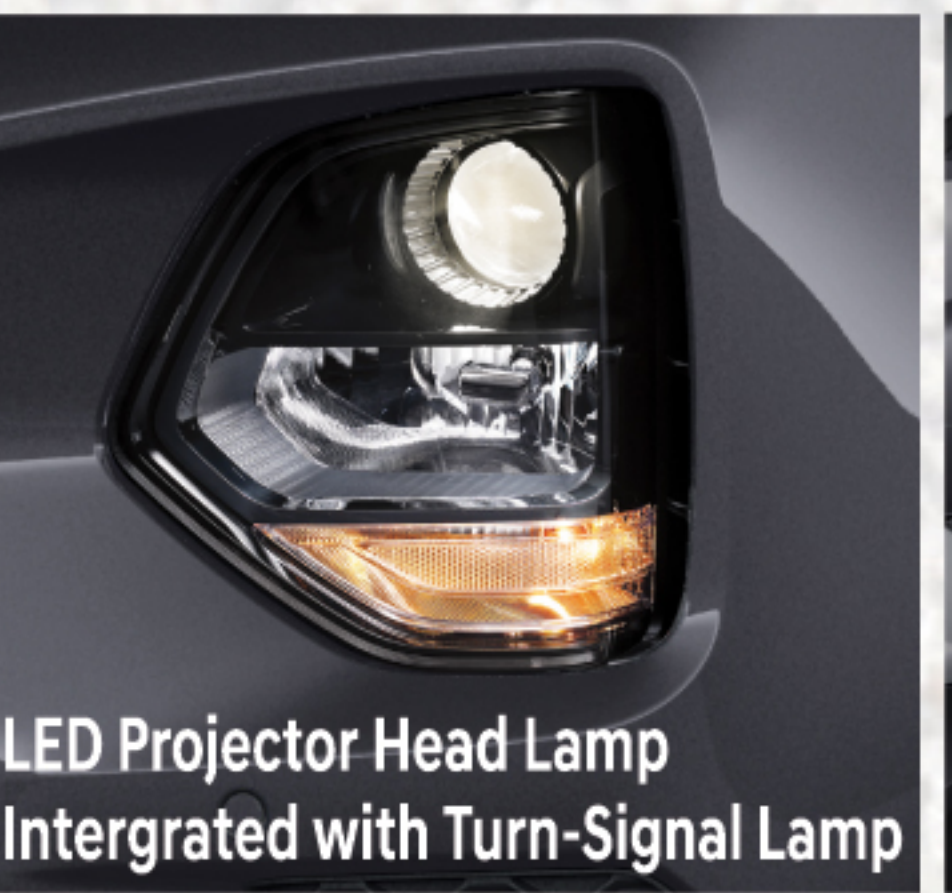
LED Projector Head Lamp Intergrated with Turn-Signal Lamp