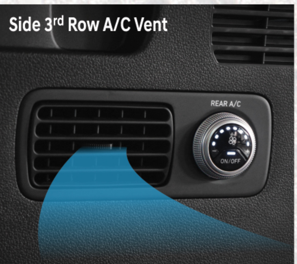
Side 3 rd Row A/C Vent