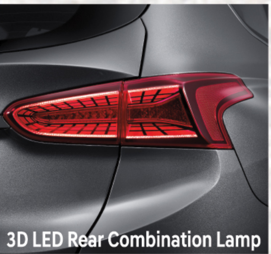
3D LED Rear Combination Lamp