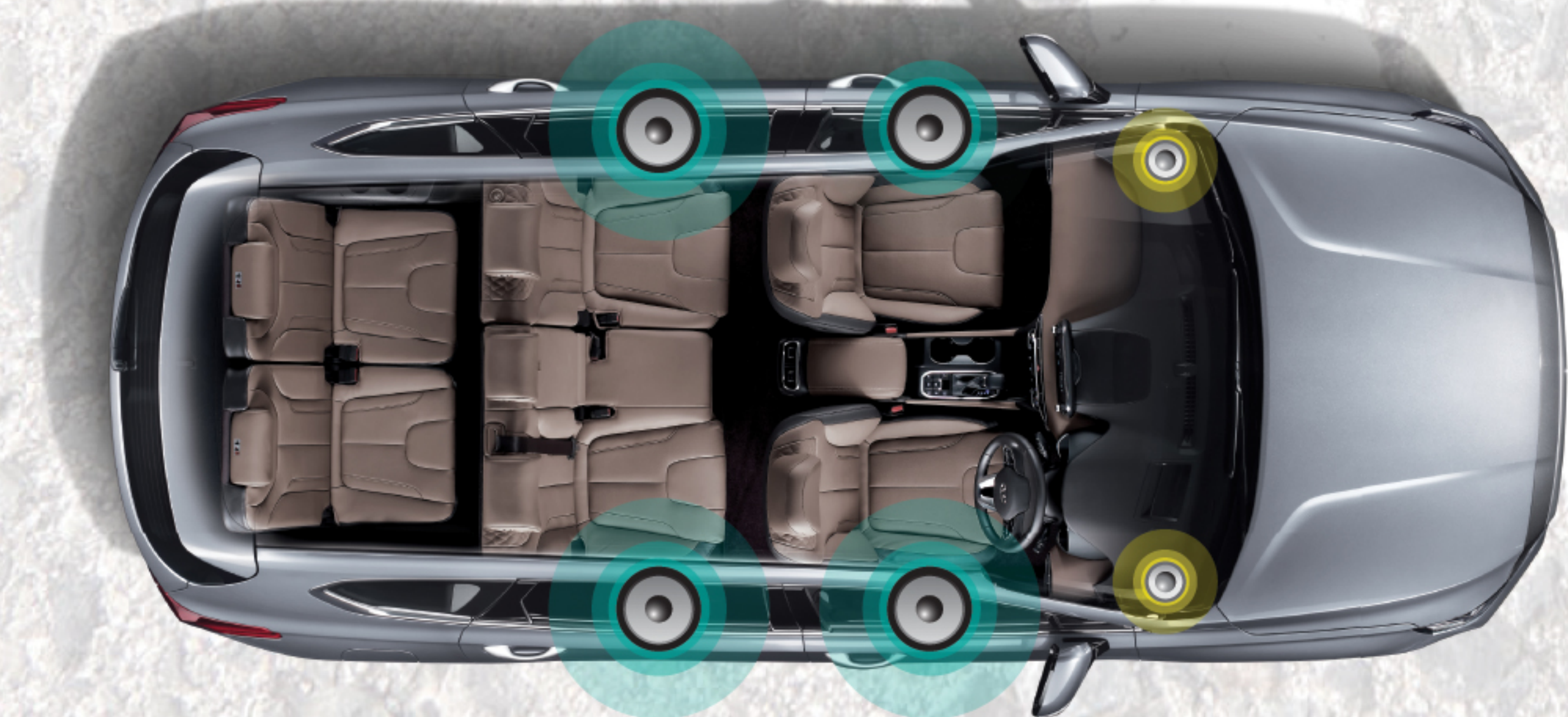
6 Speakers System