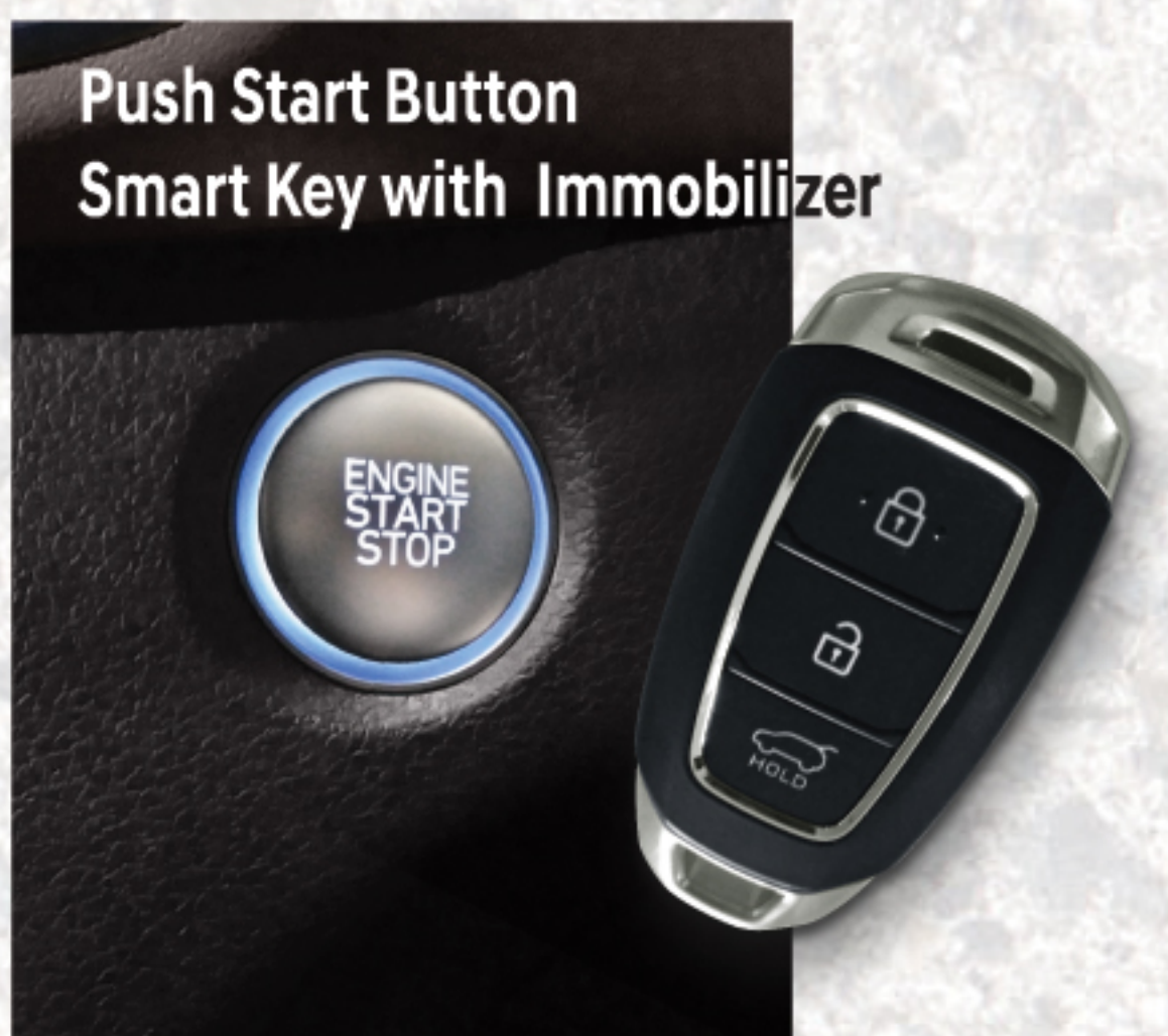
Push Start Button Smart Key with Immobilizer