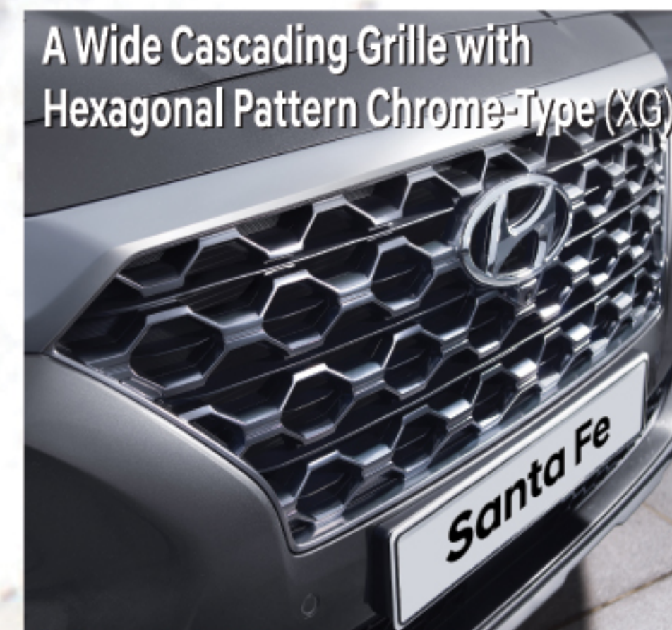
A Wide Cascading Grille with Hexagonal Pattern Chrome Type (XG)