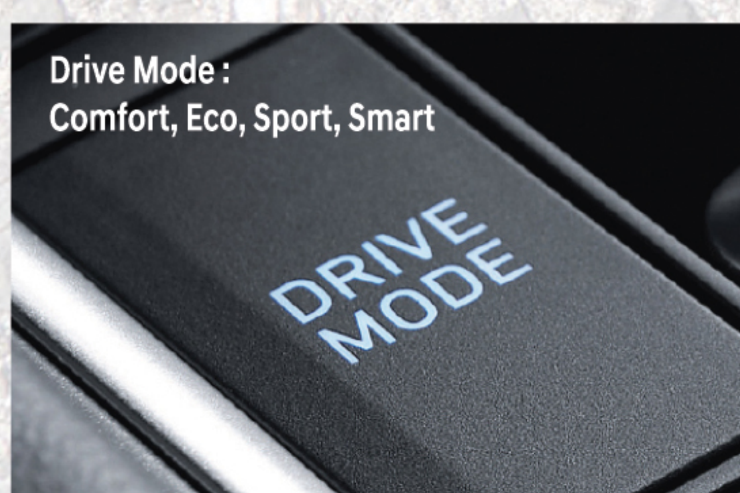
Drive Mode: Comfort, Eco, Sport, Smart