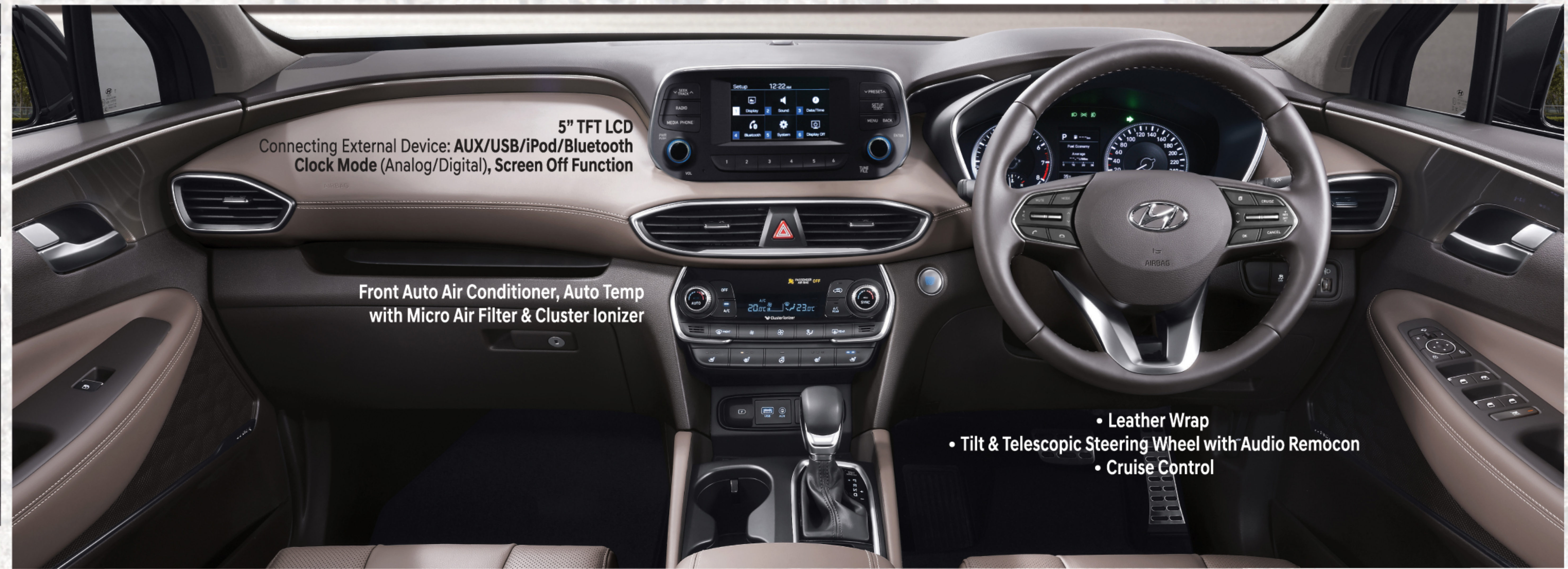
5" TFT LCD Connecting External Device: AUX/USB/iPod/Bluetooth Clock Mode (Analog/Digital), Screen Off Function