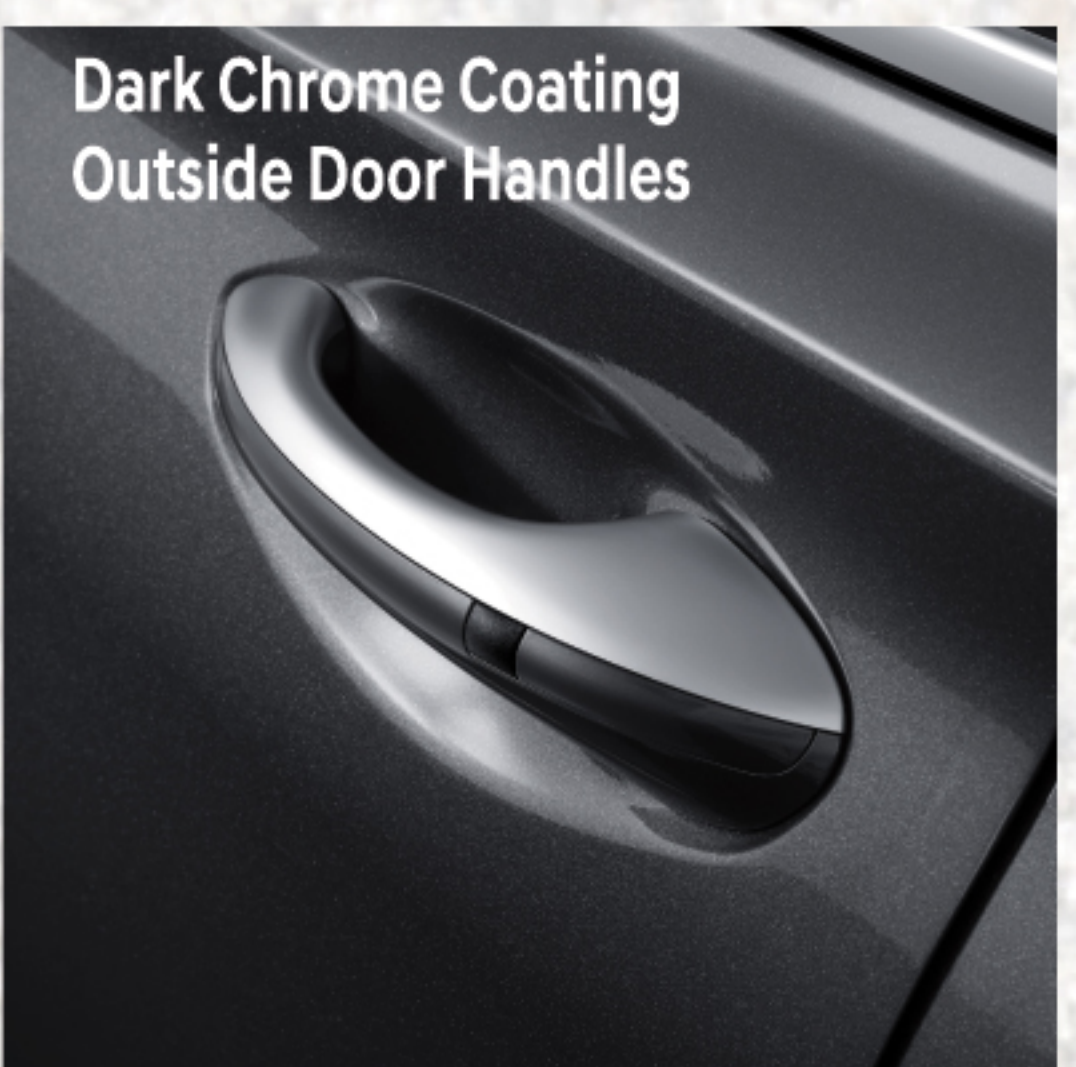
Dark Chrome Coating Outside Door Handles