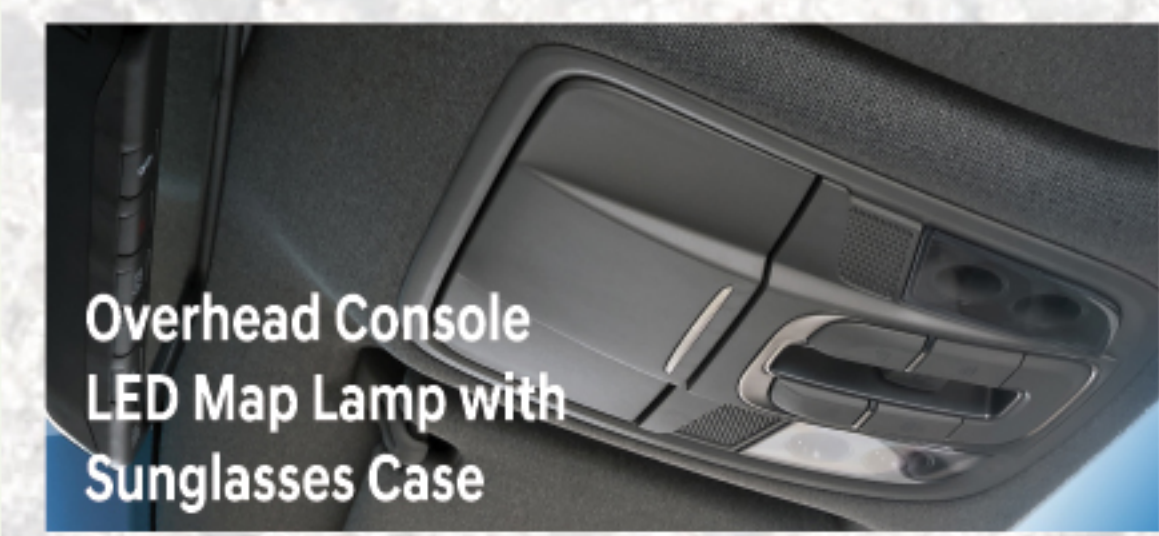
Overhead Console LED Map Lamp with Sunglasses Case