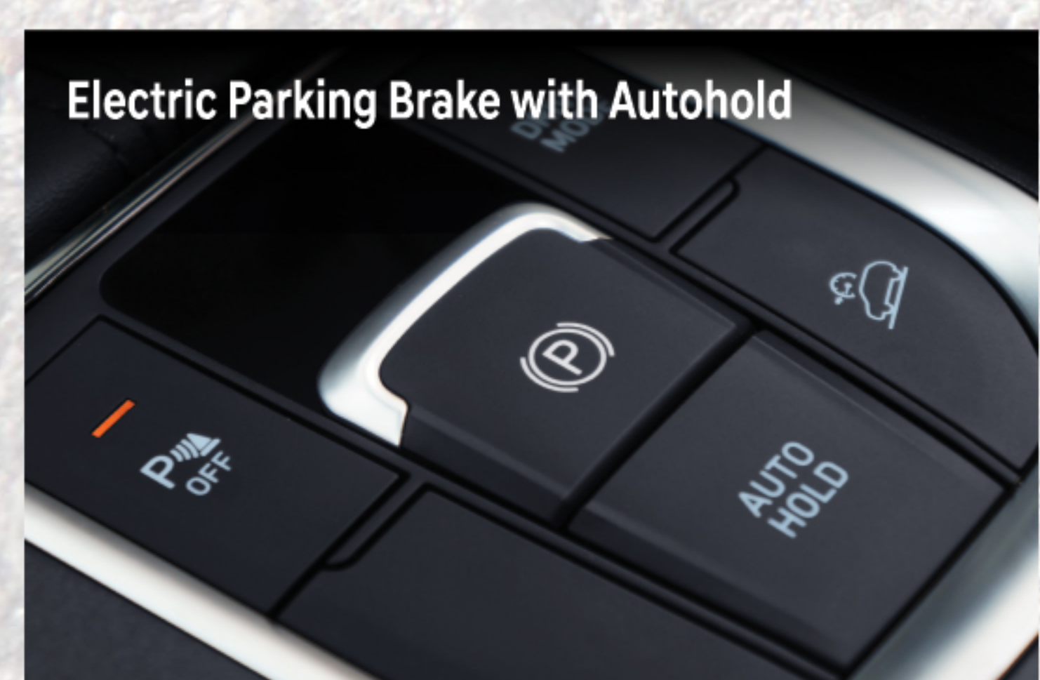
Electric Parking Brake with Autohold