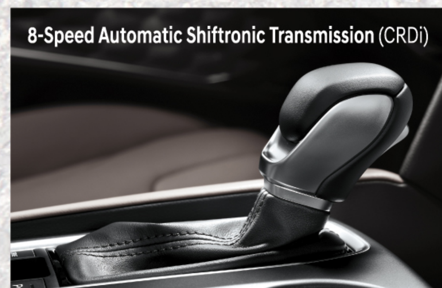
8-Speed Automatic Shiftronic Transmission (CRDi)