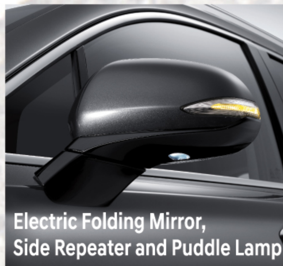
Electric Folding Mirror, Side Repeater and Puddle Lamp