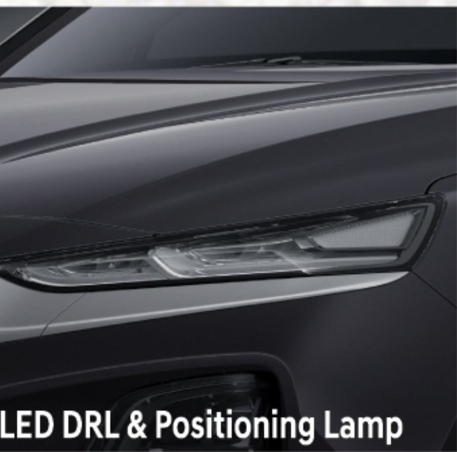
LED DRL & Positioning Lamp