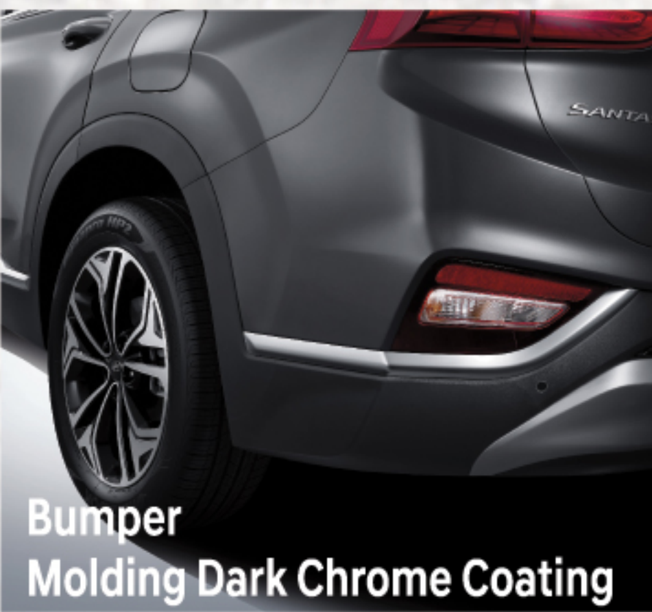
Bumper Molding Dark Chrome Coating