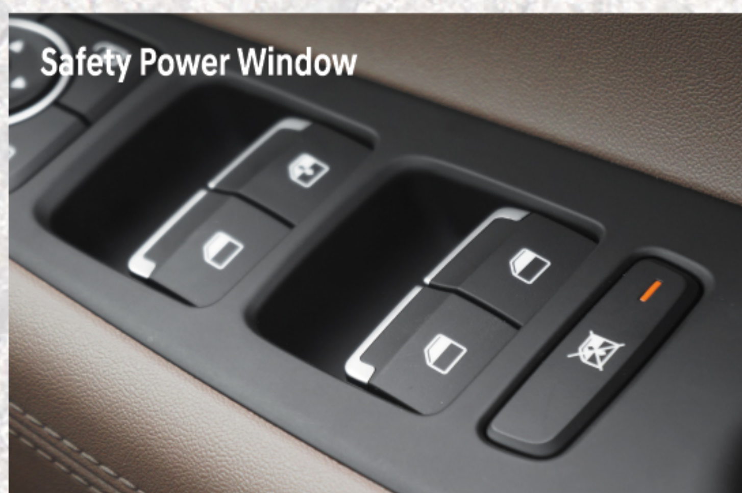
Safety Power Window