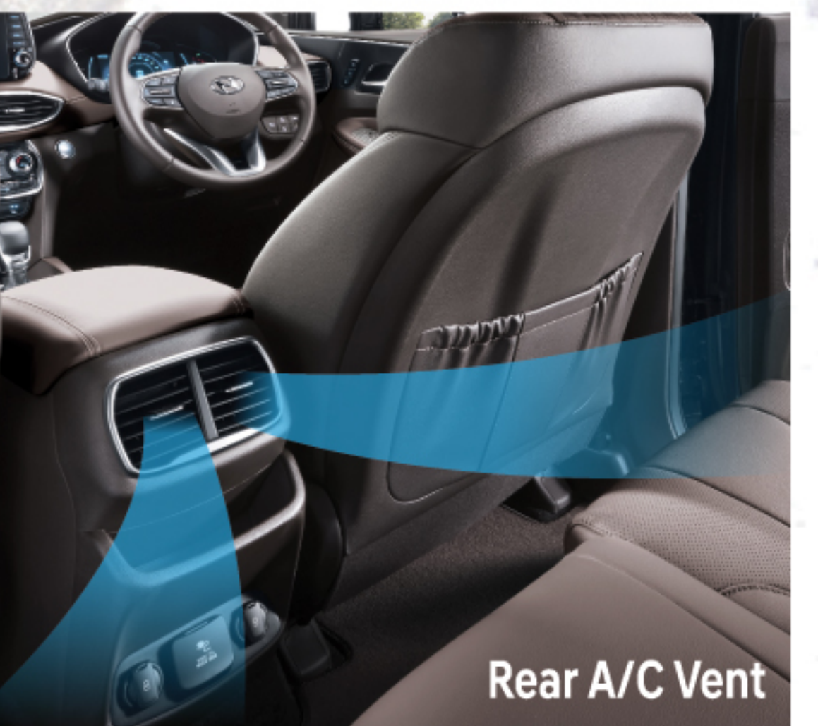
Rear A/C Vent