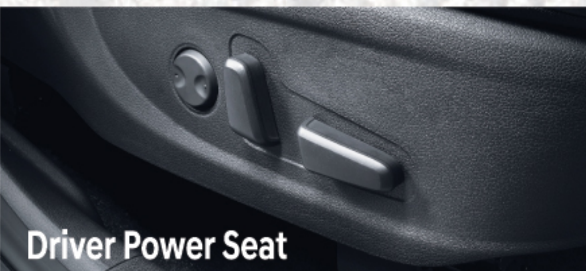
Driver Power Seat